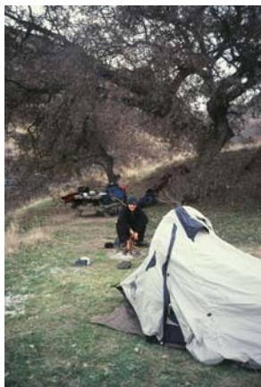
Dusty Allen at campsite in Hells Canyon

We had a couple of winter trips go; one week backpacking in the bottom of the deepest canyon in North America, Hells Canyon. It's warmer there than anywhere in the west in the winter.