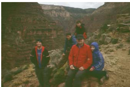
Group on hermit trail

Over spring break we had a great trip to the grand canyon. We backpacked down the seldom used Hermit Creek Trail to Granite Rapids. We had a group that ranged in age from 42 to 9.